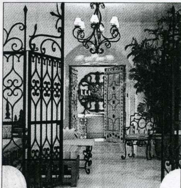
Cabo's One&Only Palmilla: Famous people magnet.